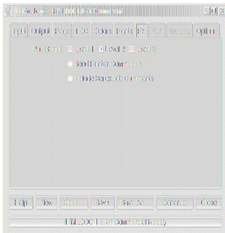
Figure 7-7 - The PS Tab

The Embed Fonts check box controls whether or not fonts are embedded in PostScript and PDF output.